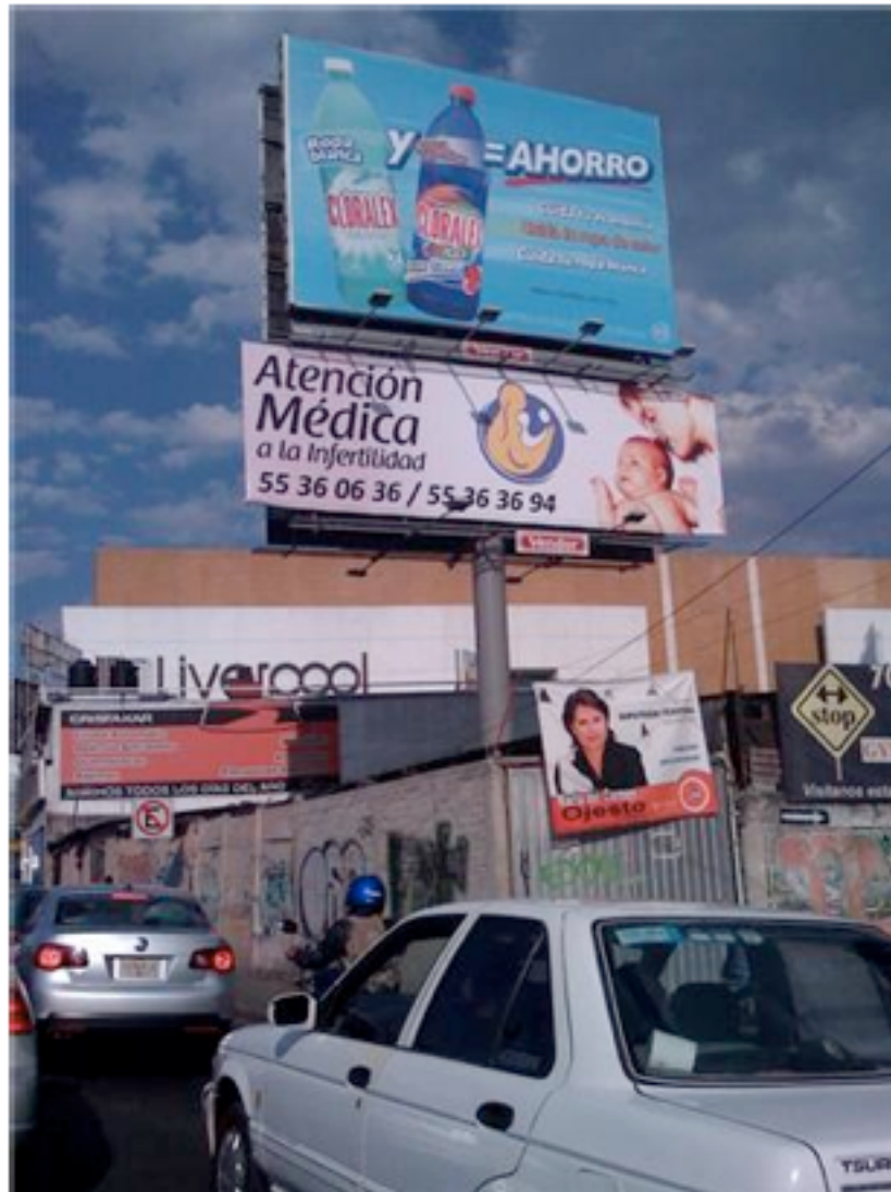
Fig. 2 Billboards in motorways and main roads in Mexico City

Likewise, media coverage of the topic also increased. For example, in a newspaper (El Reforma), only six articles about infertility and AR were published in 1999; the next year there were twenty-four. This phenomenon also happened in other newspapers (see table 4 summarising the number of articles that appeared in each newspaper analysed). Women's magazines also dedicated either single pieces (e.g. Salud y Bienestar , 2005; Mari-Claire , 2006; BbMundo , 2006; Deep , 2006; Visión Universitaria , 2006; ABC , 2006; Nexos , 2006) or entire issues to infertility and AR (e.g. Fernanda , 2006). The topic also received considerable coverage on television and radio. For example, daytime talk shows invited AR specialists and users to discuss infertility and AR (e.g. Diálogos en Confianza , channel 11, 2003), soap operas and drama series included AR in their plot line (e.g. Lo que es el amor , channel 2, 2001; Sin Pecado Concebido , channel 13, 2001; Agua y Aceite , channel 13, 2002; La Rosa de Guadalupe , channel 2, 2008), science communication